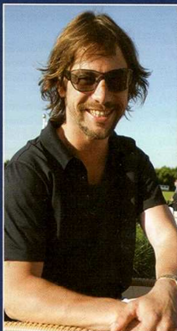
Nineties' pop sensation, Jay Kay