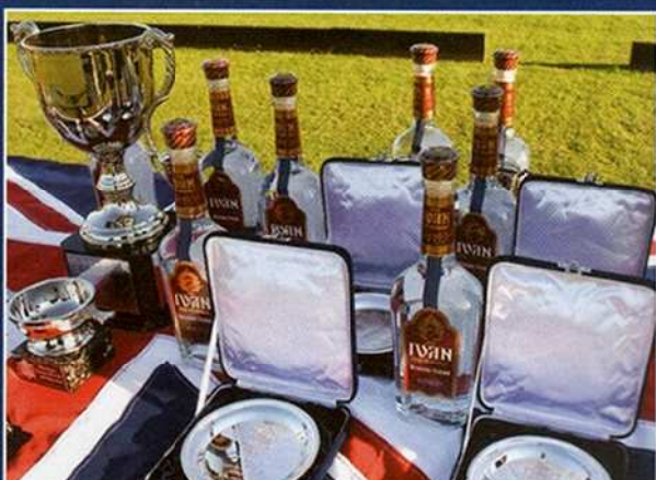
Rarely has so much vodka populated the presentation table