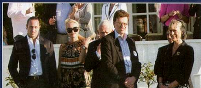
Azad and Natalia Cola, Dimitr Chebotarev and Princess Olga of Russia