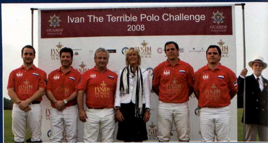
HRH Princess Olga with the victorious Moscow Polo Club side